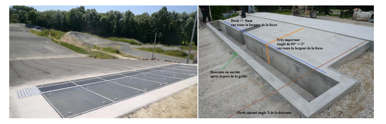
Figure 1: Photographs showing a safety start gate. This is the safest form of starting gate, and is retained on the site, totally flush.