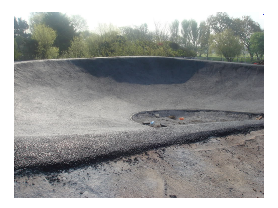
Figure 2: Photograph showing berms tarmac coated. This increases the level of grip on the corners and ensures fewer crashes while turning.